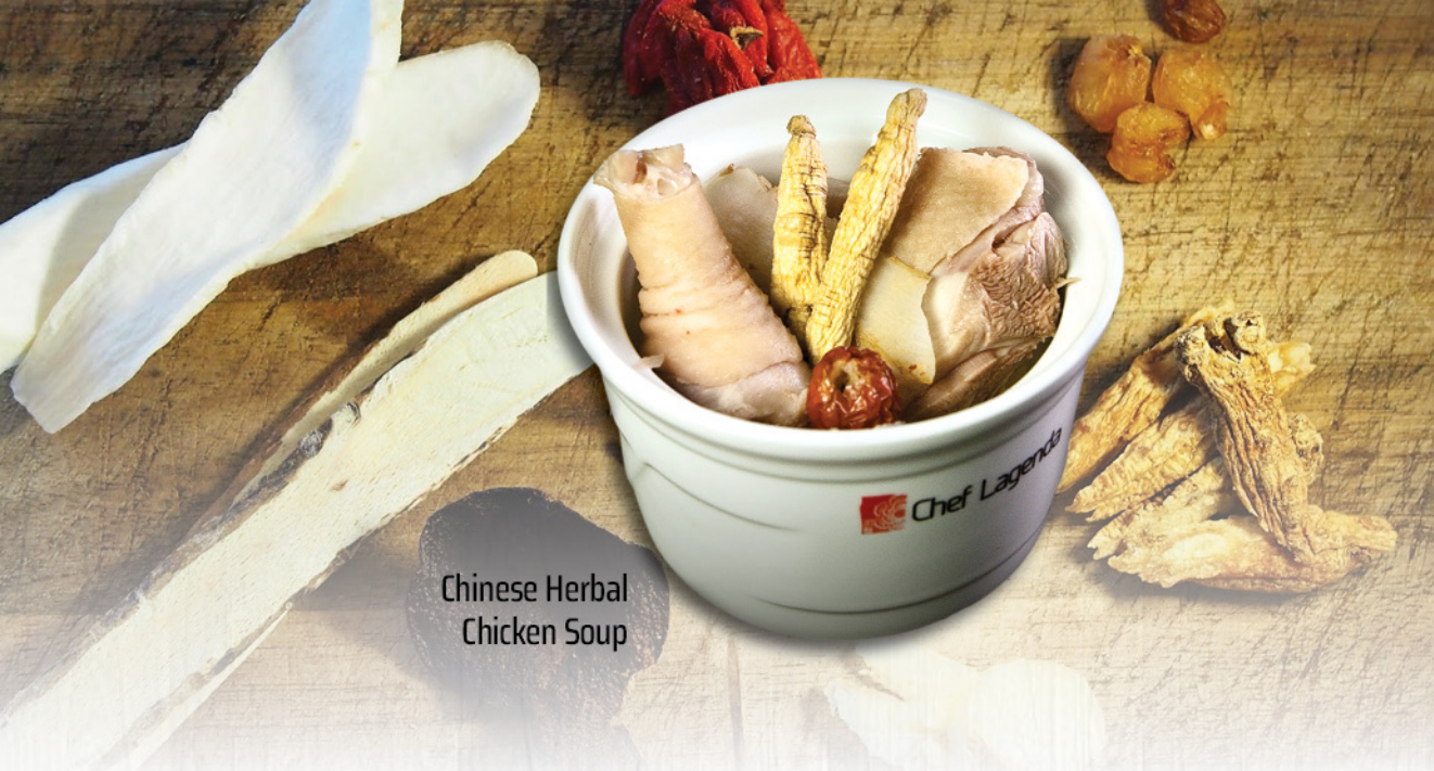
Chinese Herbal Chicken Soup