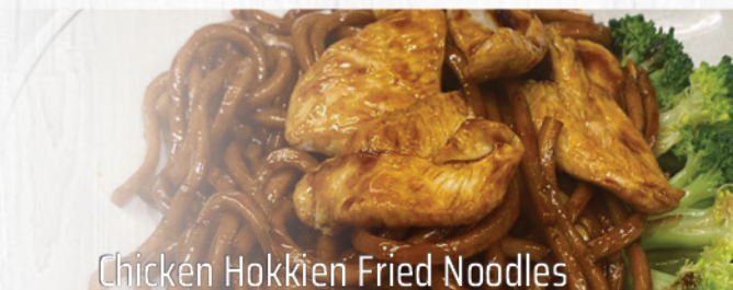
Chicken Hokkien Fried Noodles