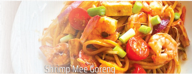
Shrimp Mee Goreng