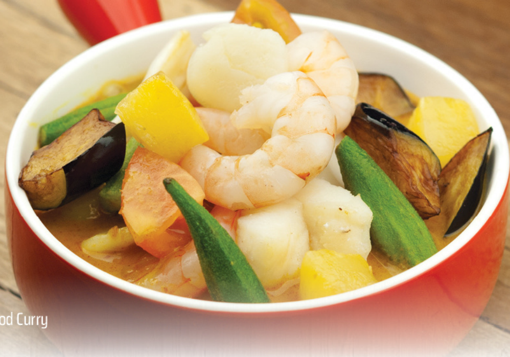
Nyonya Seafood Curry