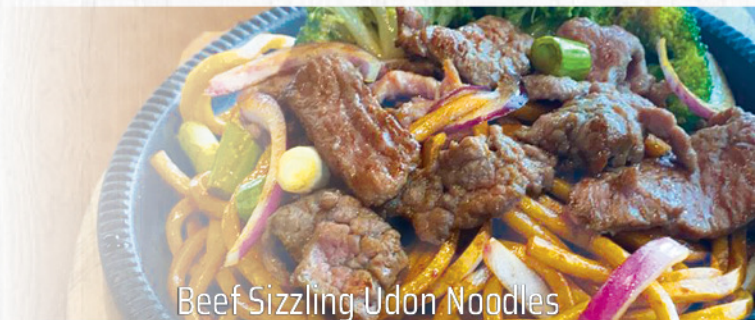
Beef Sizzling Udon Noodles