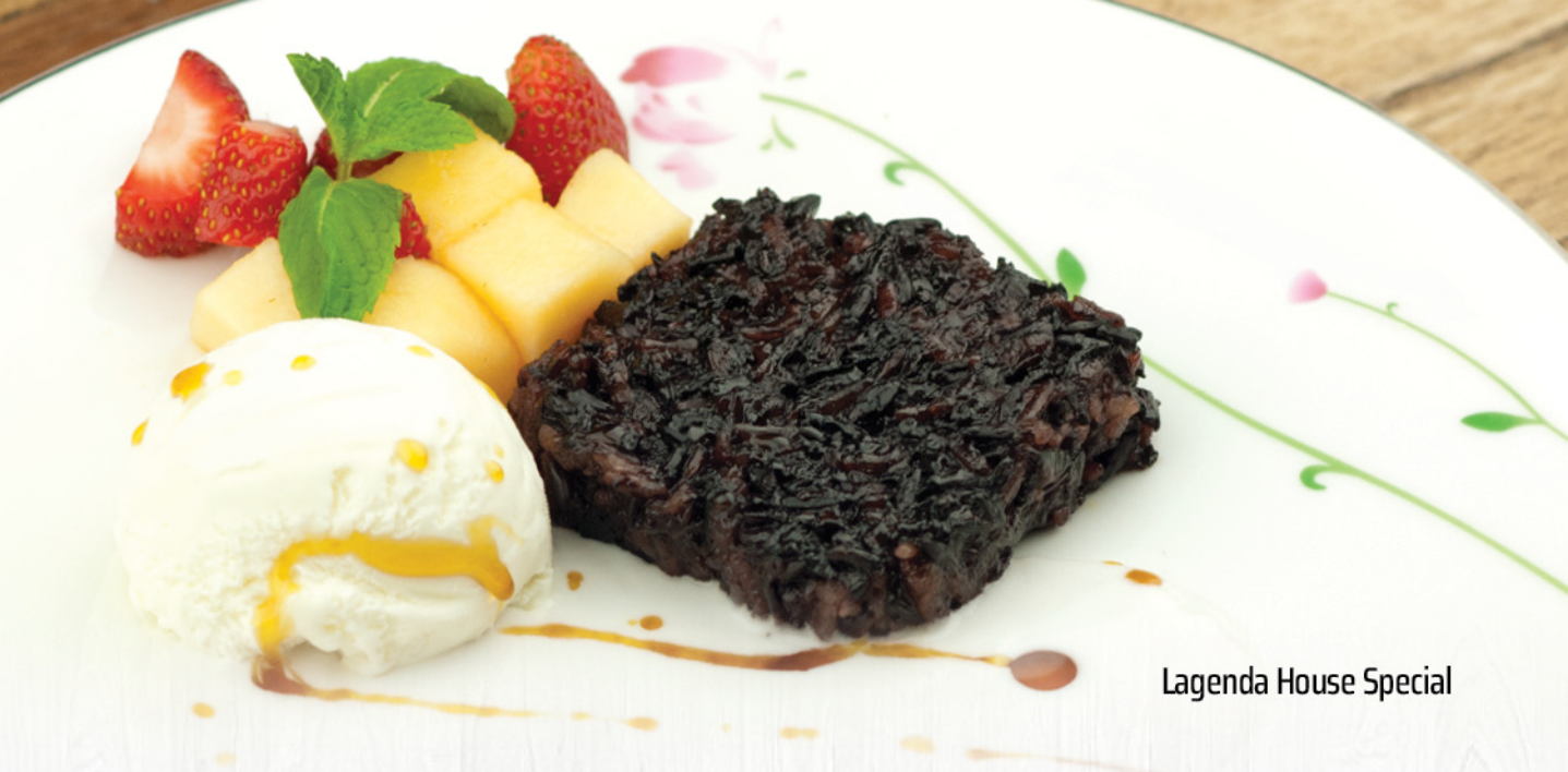
Lagenda House Special