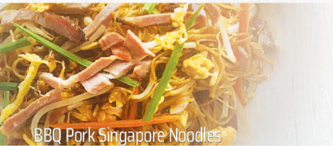
BBQ Pork Singapore Noodles