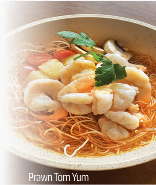
Prawn Tom Yum