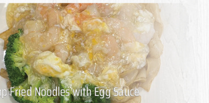
Flat Fried Noodles with Egg Sauce