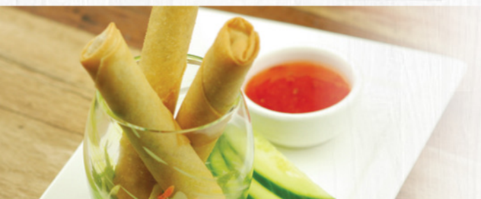
Crispy Prawn & Pork Rolls (3 pcs) 腐皮蝦卷 Deep fried pork and prawn wrapped with beancurd skin 13.4