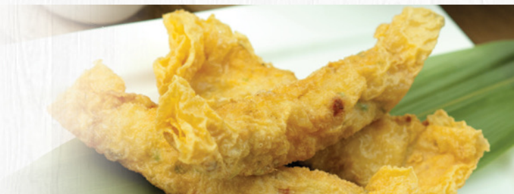
Fried Prawn Wontons (3 pcs) 炸蝦云吞 12.9