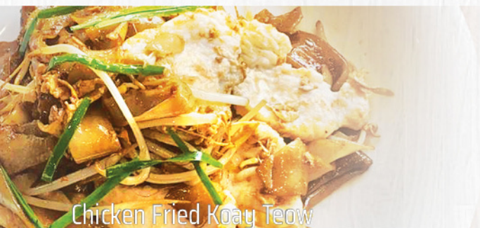
Chicken Fried Koay Teow