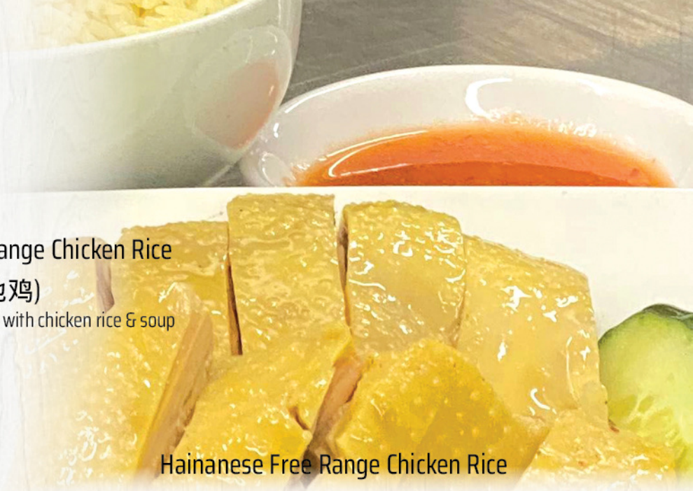
Hainanese Free Range Chicken Rice

Nasi Lemak Special 馬來什會飯 (咖哩雞或咖哩牛) 🌶️ 17.8